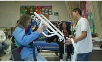
Students at YV Tech