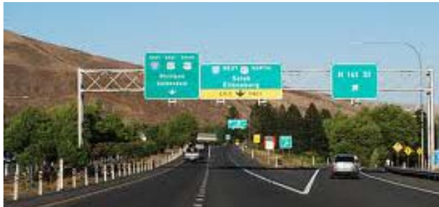
Interstate 82 - the Region's Key Connector

A region's capital improvement plan is analogous to a business plan. It identifies where investments and growth should occur in the months and years ahead. Roadway projects, waterline extensions, and wastewater treatment plant upgrades may not be glamorous, but they nonetheless often direct and facilitate where private investments are made.