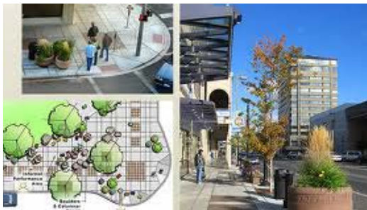
City of Yakima Streetscape Plan

Downtown Yakima continues to be Central Washington's regional hub for banking, government, and medicine, despite the exodus of major retailers and closure of the Yakima Mall in the early 2000's. Yakima's downtown has had to reinvent itself, starting with a facelift of its streetscape and infrastructure, changing its approach to retail and returning to its regional main street roots.