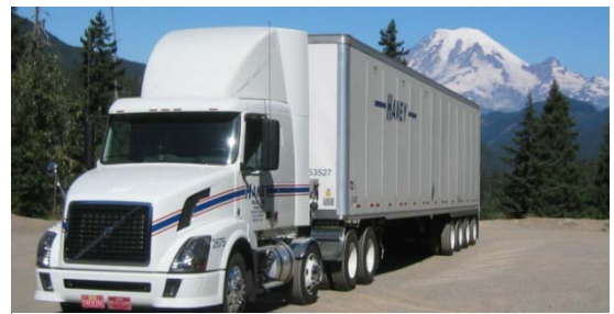
The Region is a Natural Distribution Hub

In the “Blueprint Yakima Report” (March 2008), Angelou Economics conducted a supply chain analysis of logistics and distribution. The Report identified sub-industries; truck transportation, warehousing and storage, and various scenic and sightseeing transportation (e.g., rail, water and air). Warehousing and distribution, particularly through truck transportation, are still quite relevant for the Kittitas-Yakima Region.