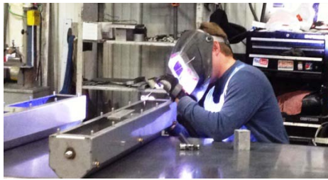
Fabricator at Magic Metals

The regional economy has potential for continued diversification, with strong growth in health care, education, viticulture and tourism. In addition, over the years, several emerging industry sectors have been identified as sources of potential growth, including but not limited to aerospace, renewable energy and wine support services and products. Agriculture continues to provide a strong base for the region, not just in terms of