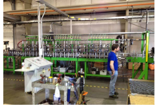
Liberty Bottles Production Line

Retention of existing industry is a cornerstone of an effective regional economic development program. Generally, it requires less effort and resources to be effective in retaining good-quality jobs than in creating new ones. The data varies, but it is widely reported that between 75-85 percent of all new jobs created are in existing companies. As a community is able to build, improve and sustain its retention program, it will be better able to hold onto businesses and jobs to build upon overall prosperity.