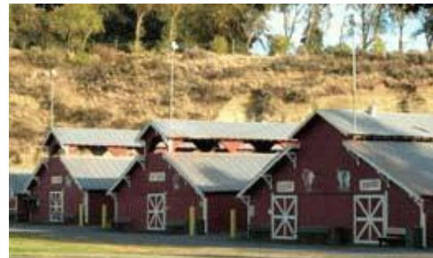
Kittitas County Fairgrounds