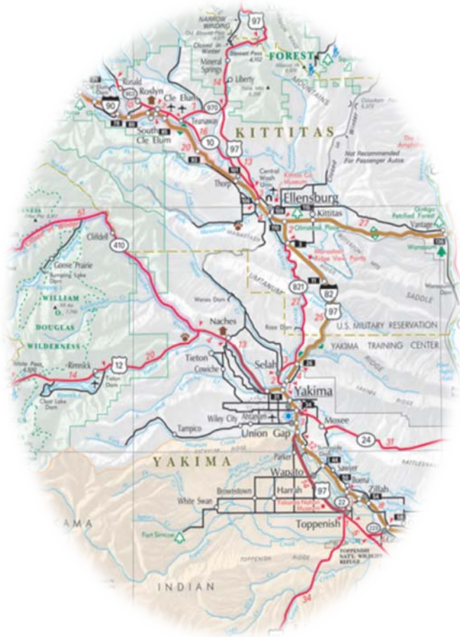
Profile of Counties

The Kittitas Yakima Economic Region is so named due to the counties it is composed of, Kittitas and Yakima Counties. Situated in central and south-central Washington State, major interstates 90 and 82 run through these counties along with a major rail route. The land area of these counties are a combined 6,592 square miles which comprise almost 10% of the entire land of Washington State 1 . Major geographical areas are the Columbia and Yakima Rivers flow through the central to eastern sections of the Kittitas Yakima Economic Region. To the west is the Cascade Mountain Range, conserved by the Snoqualmie and Wenatchee National Forests, which towers to the height of 12,281 feet in Mount Adams. Scenic view of Mount Adams, Mount Stuart, and Mount Rainier are commonplace in this region. Natural beauty is something that residents of the region enjoy all year round.