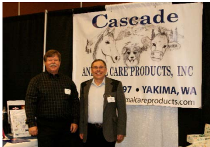
Business Plan Contestants

Encouraging entrepreneurship and helping small businesses thrive is a critical part of advancing the Central Washington economy. Across the nation, small businesses generate a lion's share of new jobs. Local communities from Roslyn to Grandview all depend on these enterprises to provide key goods and services to their residents. More importantly these small businesses generate wealth and tax revenues for their resident communities and the region as a whole.