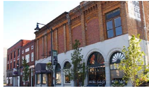
Historic Front Street in Yakima