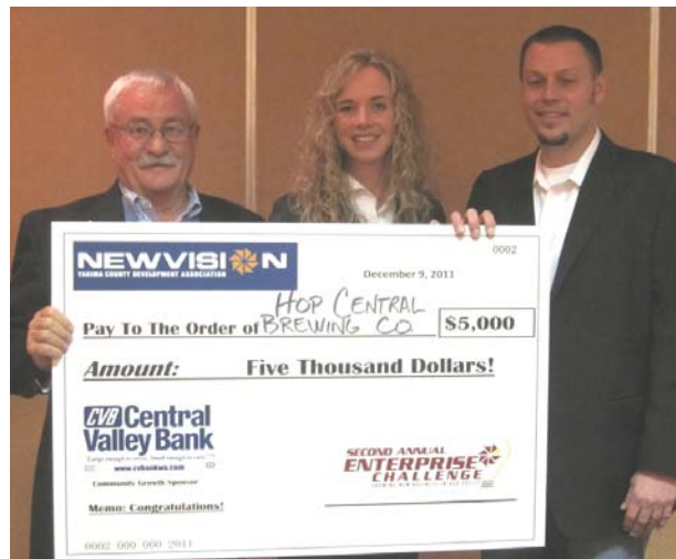
Enterprise Challenge Contest Winners