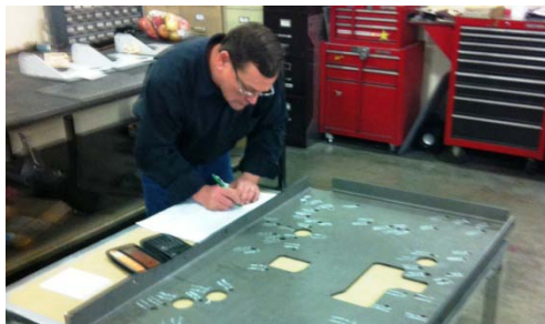
Quality Control at Magic Metals

Historically, manufacturing is a key industry in any regional economy. The region has depended upon manufacturing to provide stable employment and living wage jobs, particularly in metals and plastics. In 2001, manufacturing accounted for slightly more than 9 percent of total employment for the Kittitas-Yakima Region compared to 7 percent in King County and 6 percent nationwide. However, during the decade, manufacturing employment declined by 26.2 percent and represents slightly more than 6 percent of total regional employment in 2010.