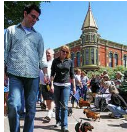
Ellensburg's Downtown is a Regional Hub

Several Kittitas-Yakima communities have made steady progress to revitalize and maintain the viability of their downtowns in the faces of both changing local demographics and visitor expectations. Downtown Ellensburg has continued to progress as a historic district and attractive draw for tourists and the diverse university population. Its commitment to following the Main Street approach and maintain professional management continues to pay dividends for the community.