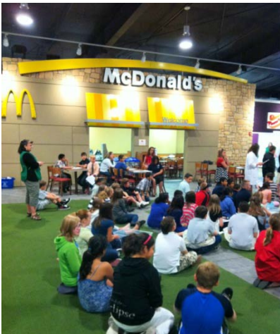
JR Achievement Builds Career Awareness