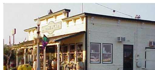
Piety Flats Winery

Another big opportunity for tourism is driven by the growing wine industry. The Yakima-Kittitas region is well positioned to capture a significant share of this market's growth and popularity. Estate wineries and production facilities are now complimented by microbreweries and distilleries which add to the region's allure. Adding bistros, specialty shops, spas, and other enterprises that compliment wine tourism is an important part of positioning the region for more affluent travelers that want a full experience.