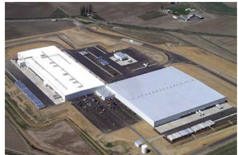
Walmart's Distribution Center Employs 600