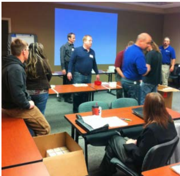
Lean Manufacturing Seminar

Retention and expansion efforts should be given a clear priority by not just the economic development organizations, but also by a cross-section of community partners. Efforts directed toward existing businesses should come in the form of team efforts among area Chambers of Commerce, local city/town governments, and education and workforce development providers. All of these entities are heavily reliant on the local business community and should place emphasis on ensuring their needs are met.