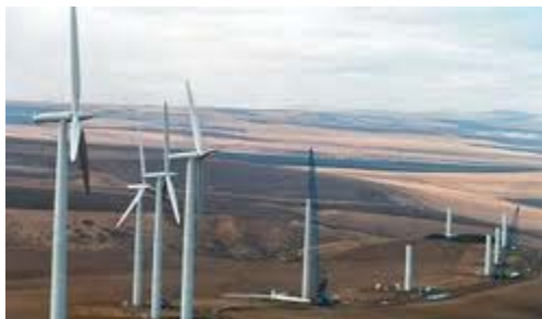
New Wind Turbines in Kittitas County

Investment in alternative sources of energy is increasing as global warming concerns,