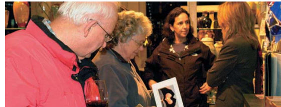
Ellensburg's First Friday Art Walk