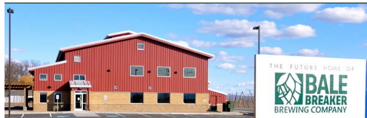
The New Bale Breaker Brewery